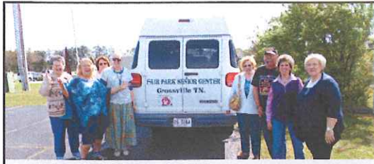
Fair Park Senior Center 931-484-7416