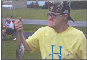
HILLOPPERS, Inc. 931-484-2535