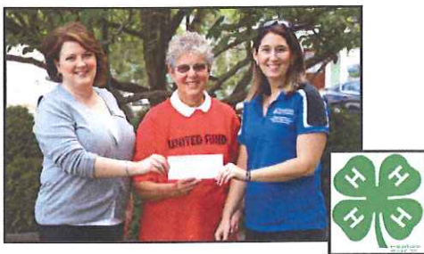
Cumberland County 4-H 931-484-6743