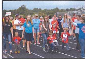
The Arc Cumberland County 931-456-0206