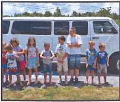
House of Hope 931-707-2273