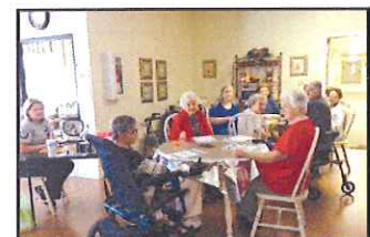
Azalea & Oakmont Gardens 931-484-2990