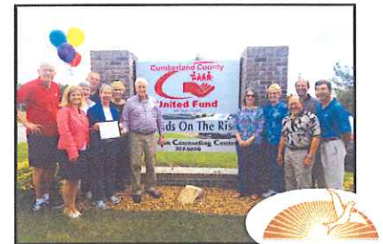
Christian Counseling Center of Cumberland Co. 931-707-8200