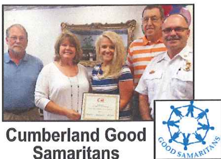
Cumberland Good Samaritans 931-484-3225