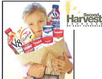
Second Harvest Food Bank 865-521-0000