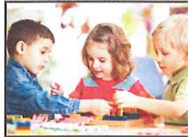
LBJ&C Head Start 931-484-4114