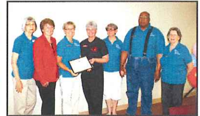
Visually Impaired Support Group (VIS) 931-787-1772