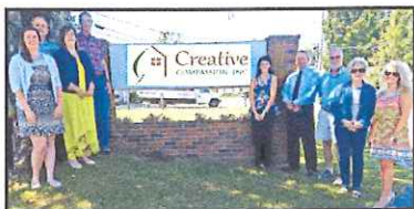
Creative Compassion, Inc. 931-456-6654