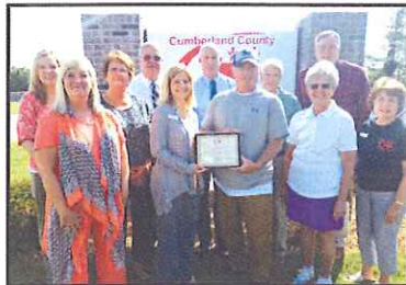
Teens Against Drugs (TAD) Center 931-456-2859