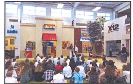
Youth Achievement Foundation 931-335-1032