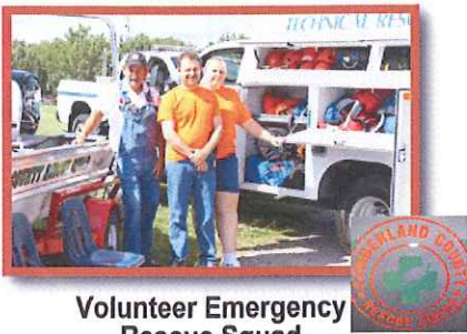
Volunteer Emergency Rescue Squad 931-337-4717