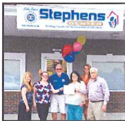
Exchange Club/ Stephens Center For The Prevention of Child Abuse 931-484-8923