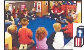
Home Away From Home Head Start & Child Care Center Cooperating Agency 931-484-3238