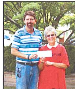
The Place of Refuge 931-707-8114