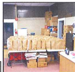
Crab Orchard Care Center 931-707-5616