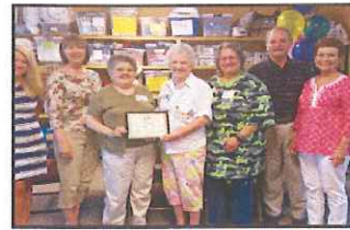
Helping Hands On Peavine Road 931-707-8606

"Reaching out to support the people of Cumberland County for over 50 years."