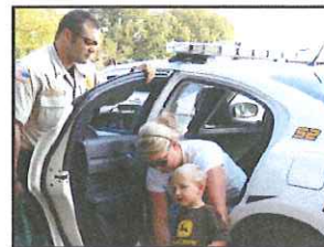
Avalon Center 931-456-0747 Crisis # 1-800-641-3434