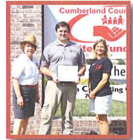
Boy Scouts 931-200-0764