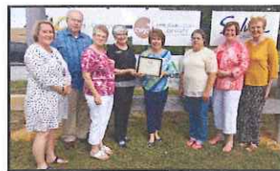
Christian Women's Job Corps 931-210-7006