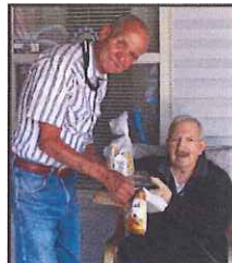
Upper Cumberland Human Resource Agency (UCHRA) 931-456-0691