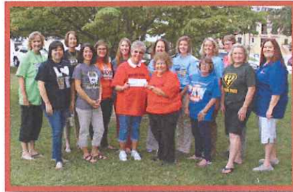
Four C's Scholarships 931-260-8868