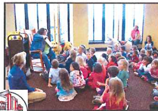
Imagination Library 931-484-6790 Ext. 241