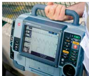
Dual-mode LCD screen with SunVue display