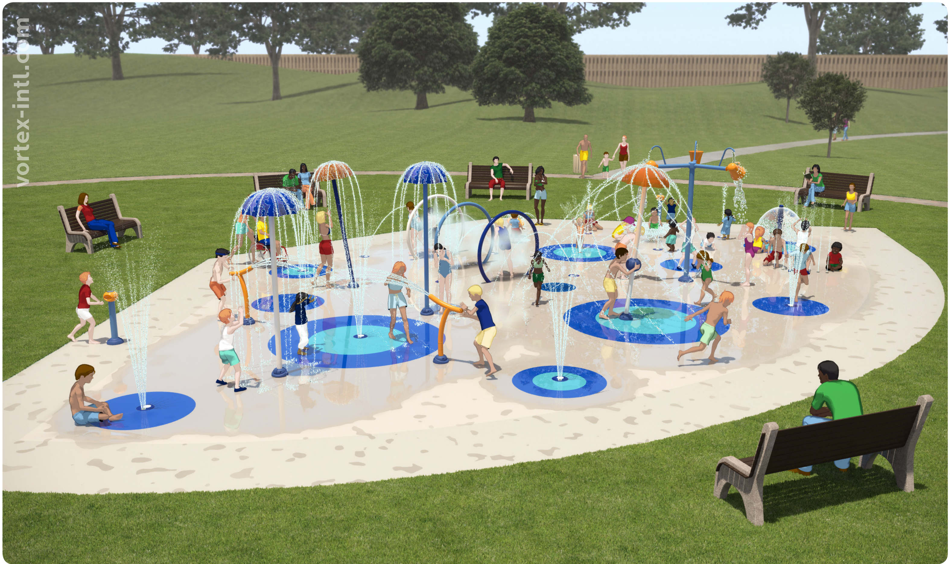
Peay Park Splashpad®, TN Revision 00 - Phase 01 - 25173