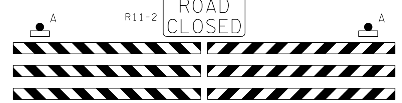
TYPE III BARRICADE ROAD CLOSURE w/ TYPE A WARNING LIGHTS