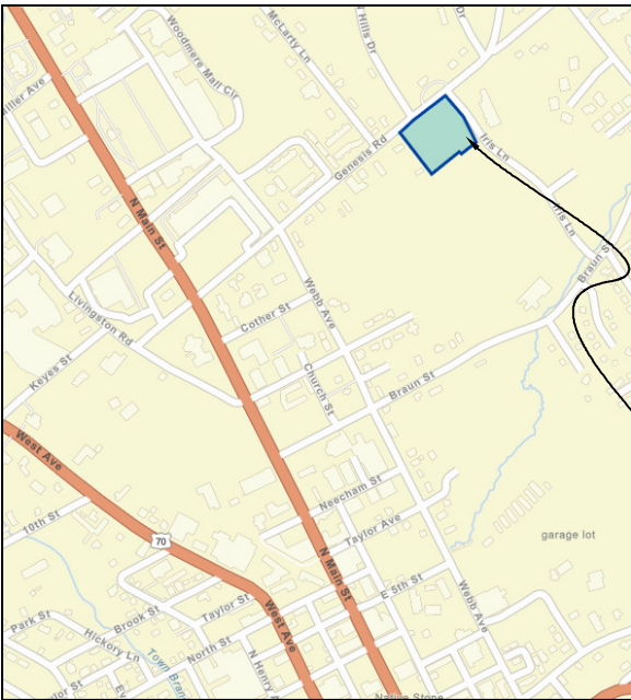
VICINITY MAP CROSSVILLE, TENNESSEE

SURVEYOR'S CERTIFICATION I hereby certify that the information shown on this plat is correct to the best of my ability and belief, these measurements were made by a field survey under the authority of TCA 61-18-12; and my supervision. This is a category 1 survey, and the ratio and precision of the unadjusted closure is 1: 10,000 as per the State of Tennessee standards of practice, Chapter 8020-3. This survey was made according to information of public record and/or observed ground evidence.